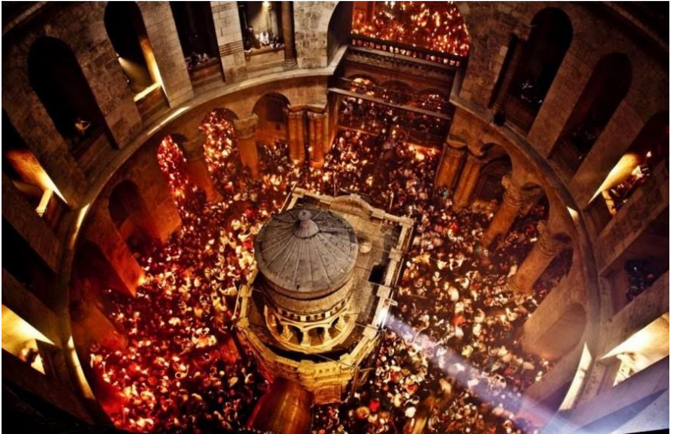
Easter Proclamation at the Tomb of Sepulchre in Jerusalem

Inspired by Christ, living and growing in faith, we are a loving and open community of worship, witness, and service in God's world.