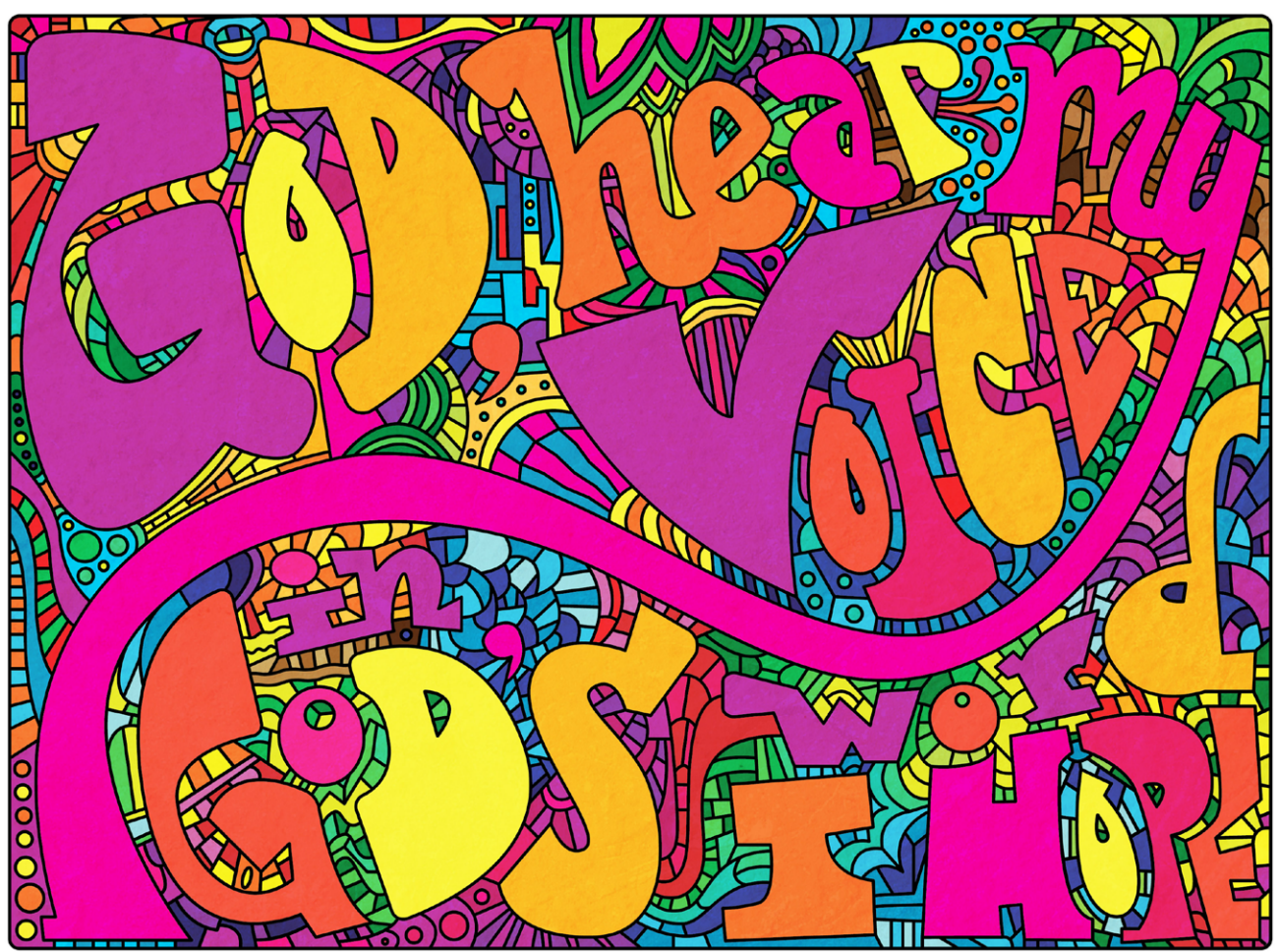
Psalm 130 · illustratedministry.com