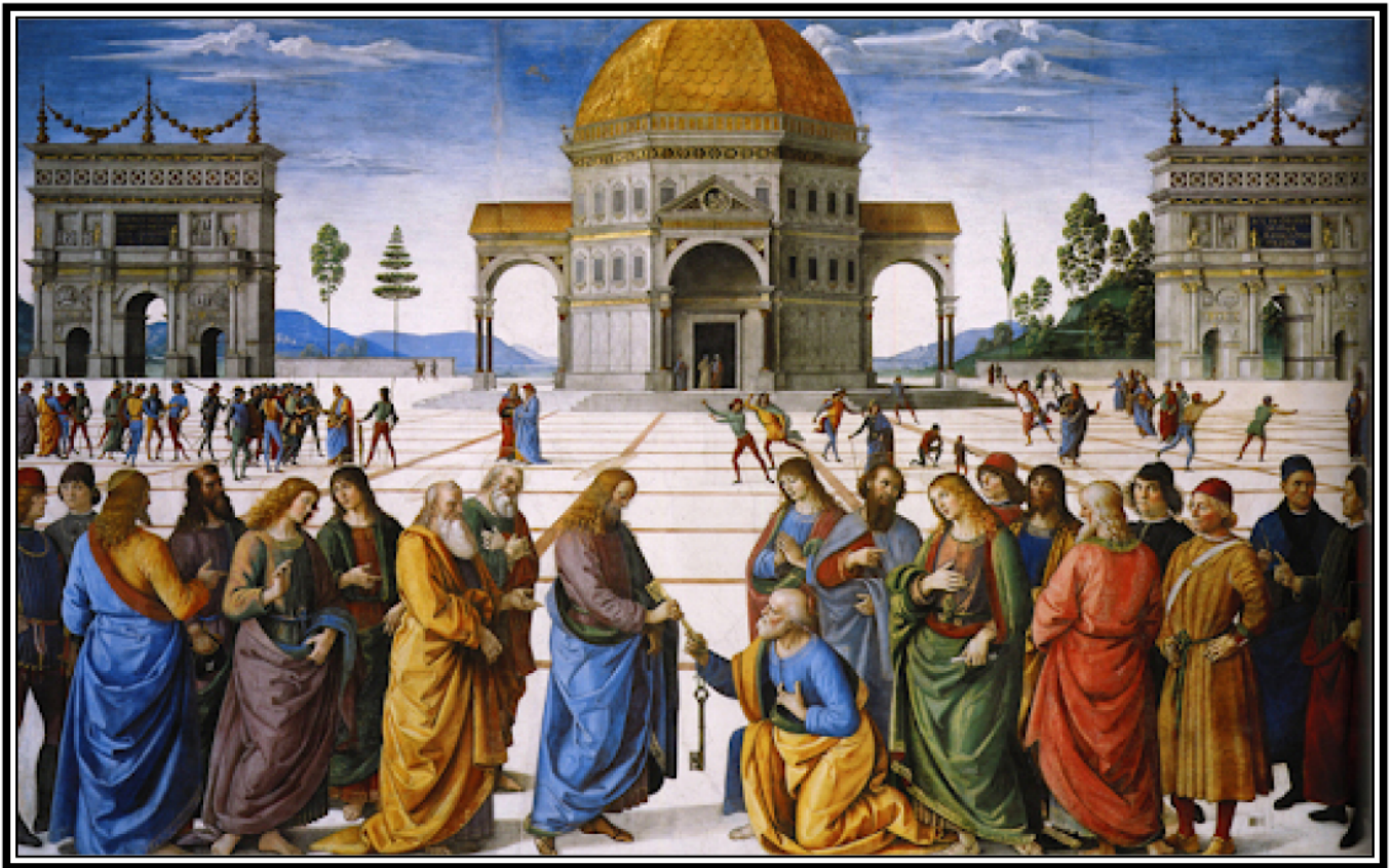
Christ Handing the Keys to St. Peter; Pietro Perugino, 1481–1482

Special thanks to the members of the ASI Spelmanslag for their music to celebrate the days of Midsommar.