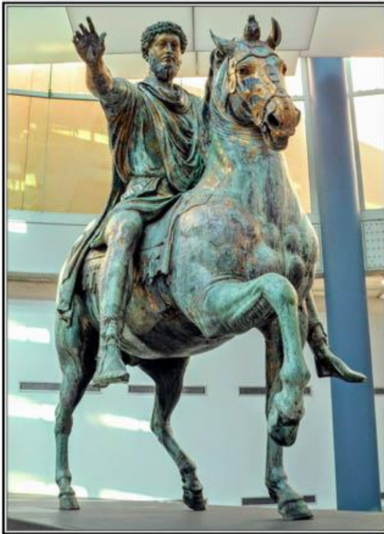
Equestrian Statue of Emperor Marcus Aurelius

In the last chapter of the Book of Acts, St. Paul finally arrives in the city of Rome, where he is immediately placed under house arrest. According to tradition he was protected by the Roman centurion for two years where he was allowed to have visitors come and speak to him.