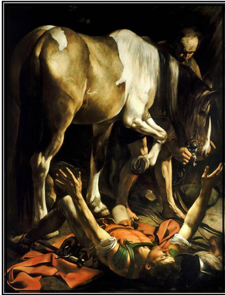
Conversion on the Way to Damascus, Michelangelo Merisi Caravaggio, 1601

The conversion of Paul is traditionally commemorated on January 25. On this day the church remembers how a man of Tarsus named Saul, a former persecutor of the early church, was turned around by God's grace to become one of its chief preachers. The risen Christ appeared to Paul on the road to Damascus and called him to preach the gospel.