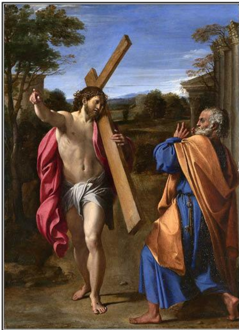
Domine, quo vadis? Annibale Carracci 1601-1602

The word of God is a refining fire. Jesus is the great divide in human history. He invites our undivided attention and devotion. Today in worship we are surrounded by a great “cloud of witnesses.” In the word and in holy communion we are invited yet again to look to Jesus, “the pioneer and perfecter of our faith.”