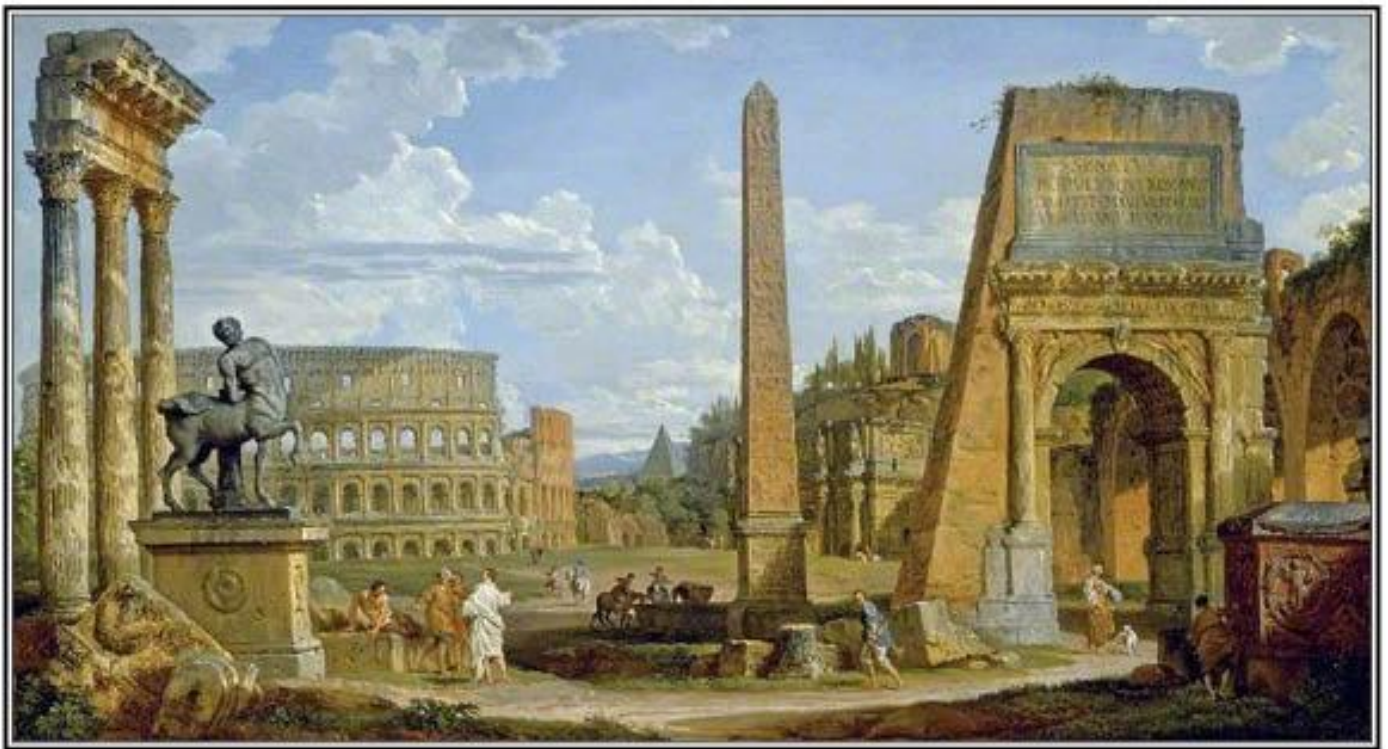
A Capriccio View of Roman Ruins, Giovanni Paolo Panini, 1737