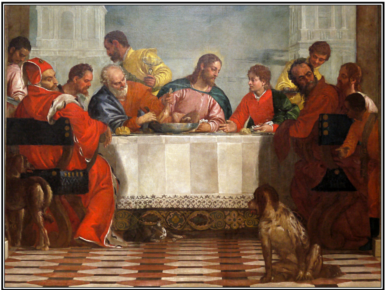
The Feast in the House of Levi, Paolo Veronese, 1563, oil on canvas

On this Rally Sunday, a day in which we welcome home friends and neighbors after a summer of travels and activities, we are reminded of why we gather. The grumbling of the religious leaders in today's gospel is actually our holy hope: This Jesus welcomes sinners and eats with them. He invites us to his table to be nurtured and strengthened and to enjoy his company. As St. Paul reminds Timothy in his first letter to him, The saying is sure and worthy of full acceptance, that Christ Jesus came into the world to save sinners. Thanks be to God.