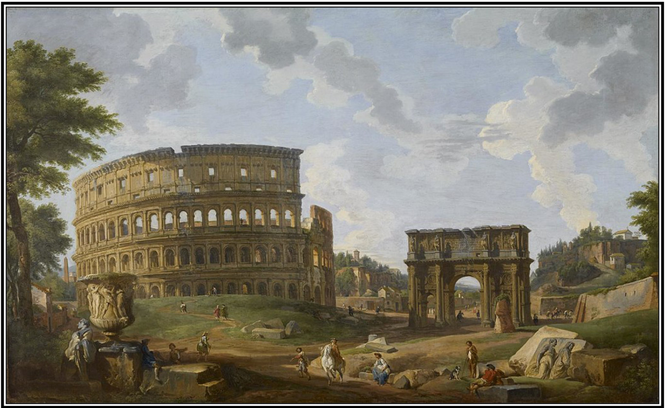
Colosseum by Giovanni Paolo Panini