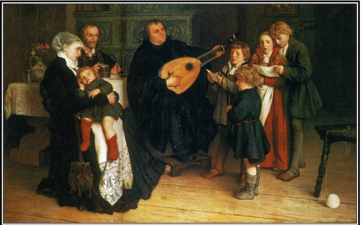
Luther Making Music in the Circle of His Family, Gustav Spangenberg, 1875

Rooted in the past and growing into the future, the church must always be reformed in order to live out the love of Christ in an ever-changing world. We celebrate the good news of God's grace, that Jesus Christ sets us free every day to do this life-transforming work.