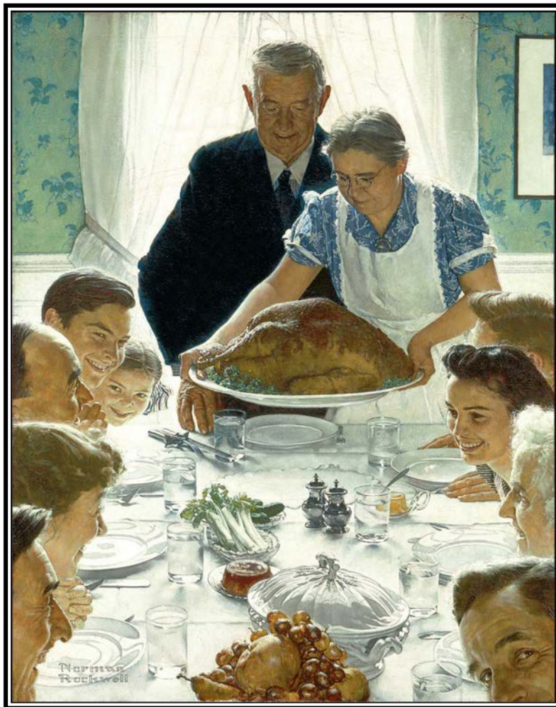
Freedom From Want, Norman Rockwell, 1943

This morning also marks the end of our annual stewardship campaign, as well as the end of the church year known as Christ the King Sunday.