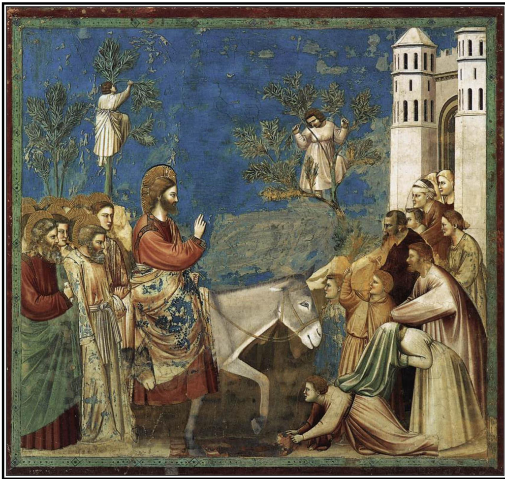
The Entry into Jerusalem, Giotto, 1305

The Sunday closest to St. Andrew's Day, November 30th, also marked the First Sunday of Advent.