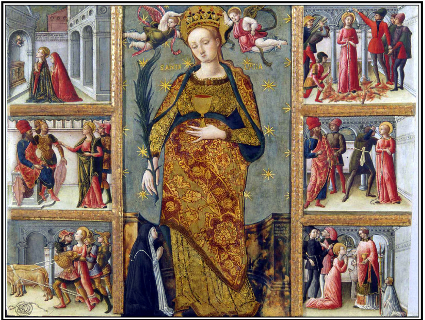
Saint Lucia from the story of her life, Quirizio di Giovanni da Murano 1460-1478

A note of joyful expectation marks today's worship. Isaiah announces that the desert shall rejoice and blossom, and Jesus points to the unexpected and transforming signs of God's reign. We wait with patience for the coming of the Lord, even as we rejoice at his presence among us this day: in word and holy supper, in church and in our homes, in silent reflection and in works of justice and love. We pray that God would open our eyes and ears to the wonders of Christ's advent among us.