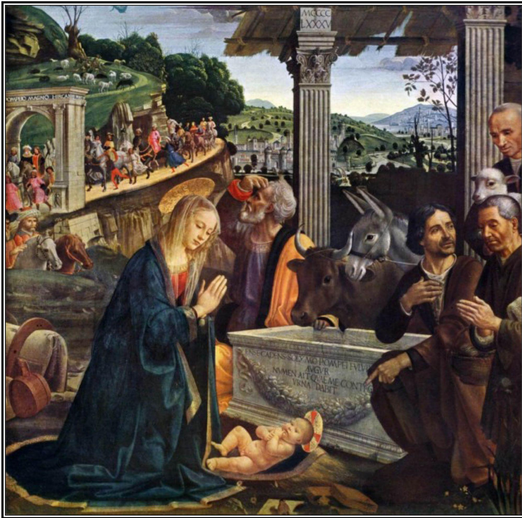
Adoration of the Shepherds, Domenico Ghirlandaio, 1485

As on the first day of creation, on this Christmas Day the Word illumines the world, shining forth to bring all things into being. Today we celebrate the incarnate Word, God becoming flesh to live among us in the person of Jesus Christ then and now. Emboldened by the good news of Christ's birth, along with the shepherds, Mary and Joseph, and all witnesses to the light of Christ, we declare to the world that we have indeed seen and been transformed by the arrival of "the salvation of our God." O come, let us adore him!