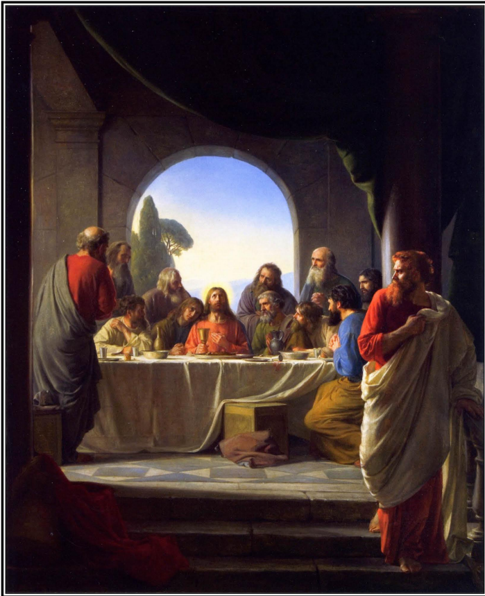
Judas Retiring from The Last Supper, Carl Bloch, late 19th c

This day our lenten observance comes to an end, and we gather with Christians around the world to celebrate the Three Days of Jesus' death and resurrection. Today we remember Christ's last meal with his disciples and his commandment that we love one another through humble service.