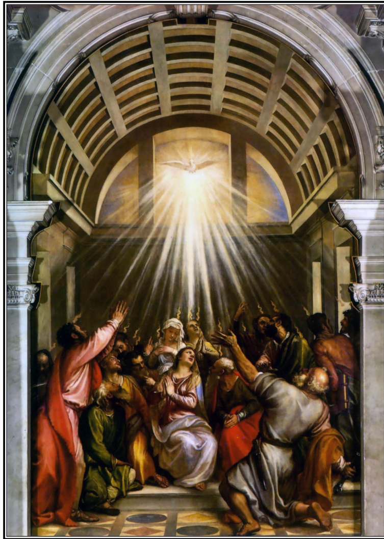
Pentecost, Tiziano, 1546

Pentecost derives its name from the Jewish festival celebrating the harvest and the giving of the law on Mount Sinai fifty days after Passover. Fifty days after Easter, we celebrate the Holy Spirit as God's presence within and among us. In Acts the Spirit arrives in rushing wind and flame, bringing God's presence to all people. Paul reminds us that though we each have different capacities, we are unified in the Spirit that equips us with these gifts. Jesus breathes the Holy Spirit on his disciples, empowering them to forgive sin. We celebrate that we too are given the breath of the Holy Spirit and sent out to proclaim God's redeeming love to all the world.