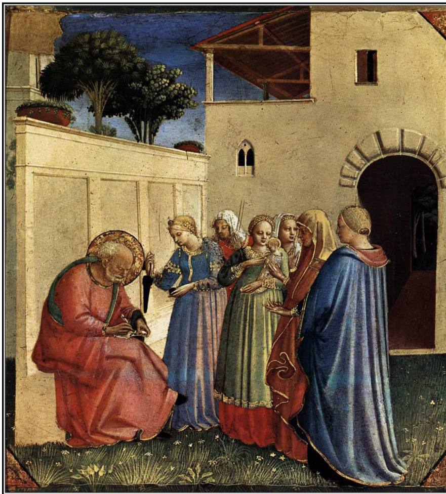
Naming of Saint John the Baptist, Fra Angelico, 1434-1435

The feast day for John the Baptist is traditionally celebrated on June 24 th .