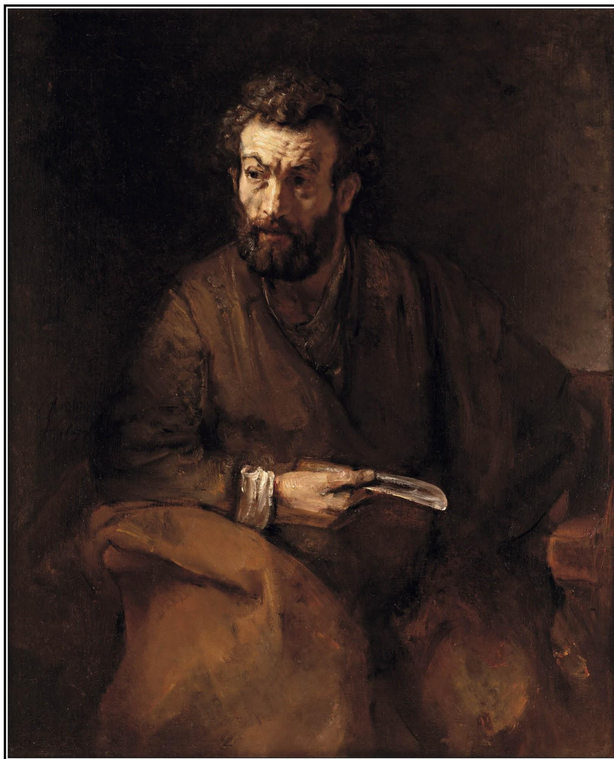
Saint Bartholomew, Rembrandt van Rijn, 1657

Some traditions say Bartholomew preached in India and Armenia following the resurrection. In art, Bartholomew is pictured holding a flaying knife to indicate the manner in which he was killed.