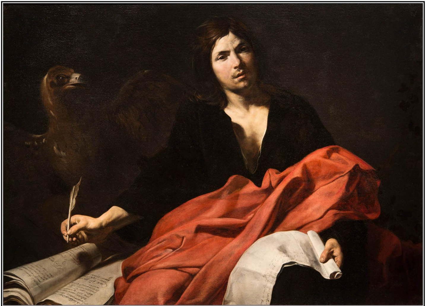
Saint John the Evangelist, Valentin de Boulo, 1622-23

Christmas through his proclamation that the Word became flesh and dwelt among us. His traditional commemoration date is December 27th. In scripture John is often portrayed as a young man with either a quill in his hand or an eagle in the background.