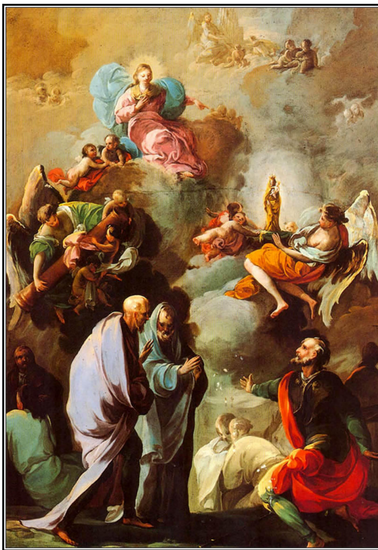
Apparition of the Virgin of the Pillar to St. James at Zaragoza, Francisco de Goya, 1768

James is one of the sons of Zebedee, who together with his younger brother John, are known as the sons of thunder. James was the first of Jesus' twelve disciples to suffer martyrdom and is the only apostle whose martyrdom is recorded in scripture. He is called the Elder or the Greater to distinguish him from James the Less, the son of Alphaeus, and James the Wise, the brother of Jesus.