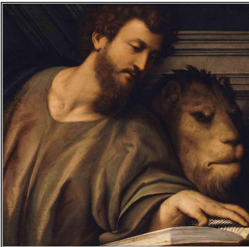
Saint Mark the Evangelist, Giovanni Antonio da Pordenone 1535

Though Mark himself was not one of Jesus' 12 disciples, it is likely that he was a member of one of the early Christian communities. It is possible that he is the John Mark of Acts 12 whose mother owned the house where the apostles gathered. The gospel attributed to him is brief and direct. It is considered by many to be the earliest gospel. Tradition has it that Mark went to preach in Alexandria, Egypt, became the first bishop there, and was martyred.