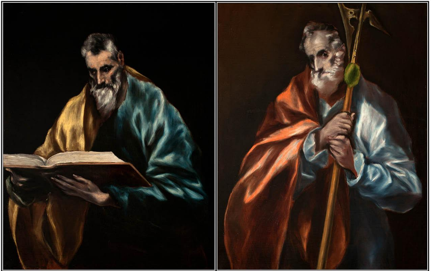
Saint Simon & Saint Jude, El Greco 1610-1614

Little is known about Simon and Jude. In the New Testament lists of the apostles, Simon the “zealot” or Cananaean is mentioned, but he is never mentioned apart from these lists. Jude, sometimes called Thaddeus, is also mentioned in the lists of the Twelve. At the last supper Jude asked why he chose to reveal himself to the disciples but not to the world. A traditional story about Simon and Jude says that they traveled together on a missionary journey to Persia and were both martyred there.