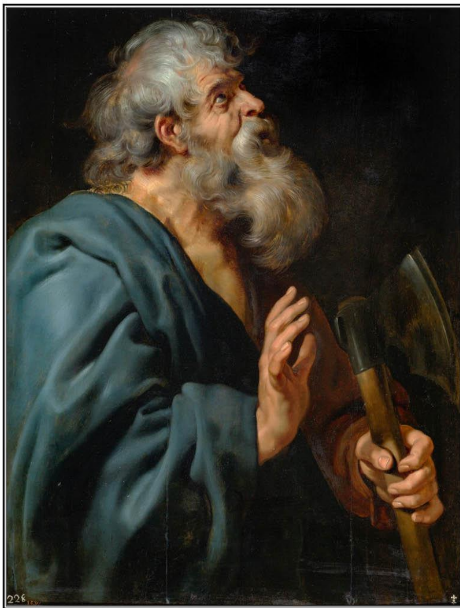
Saint Matthias, Peter Paul Rubens, 1611

After Christ's ascension, the apostles met in Jerusalem to choose a replacement for Judas Iscariot. Matthias was chosen over Joseph Justus by the casting of lots.