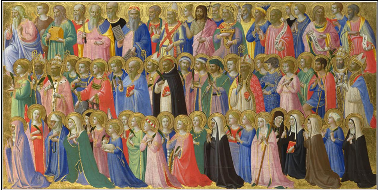
The Forerunners of Christ with Saints and Martyrs, Fra Angelico, 1423-4

Once again we welcome the Zuhrah Shrine Dixie Kats to our Rally Sunday worship service.