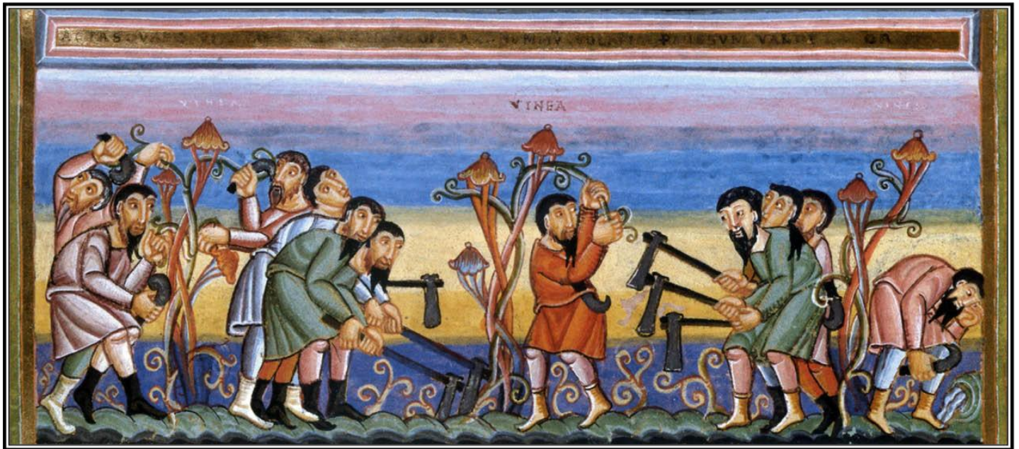
Parable of the Workers in the Vineyard, Codex Aureus of Echternach, 11c

His feast day is traditionally marked on October 4th.