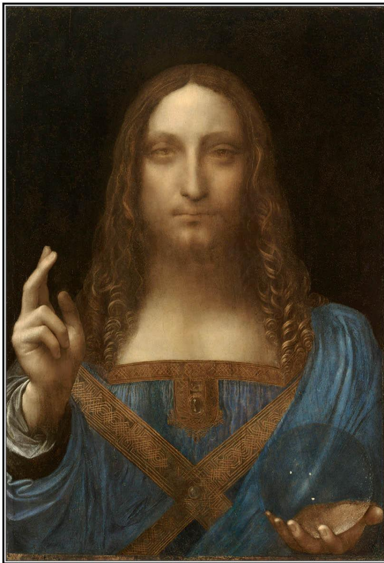
Salvator Mundi , Leonardo da Vinci, 1499–1510, oil on walnut panel

We gather this day to celebrate the reign of Christ and his victory over death, yet we await the consummation of all things yet to come. Acknowledging Christ as our merciful ruler, we go forth that his reign may be known in our loving words and deeds.