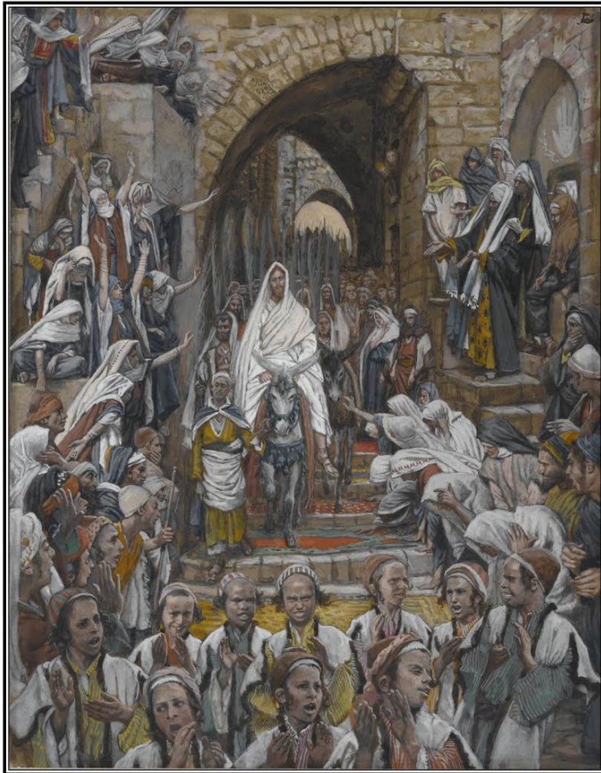
The Procession in the Streets of Jerusalem, James Tissot, 1886-1894

Today we begin the new church year with the First Sunday of Advent. Advent, which means coming, is a season of hoping, waiting, yearning and preparing, but for what and for whom? In many old Lutheran liturgies, the story of Jesus' entry into Jerusalem was the gospel story read on this Sunday. It was a colorful reminder that it is not simply a baby in Bethlehem entering into our story, but it is a savior who comes in the name of the Lord.