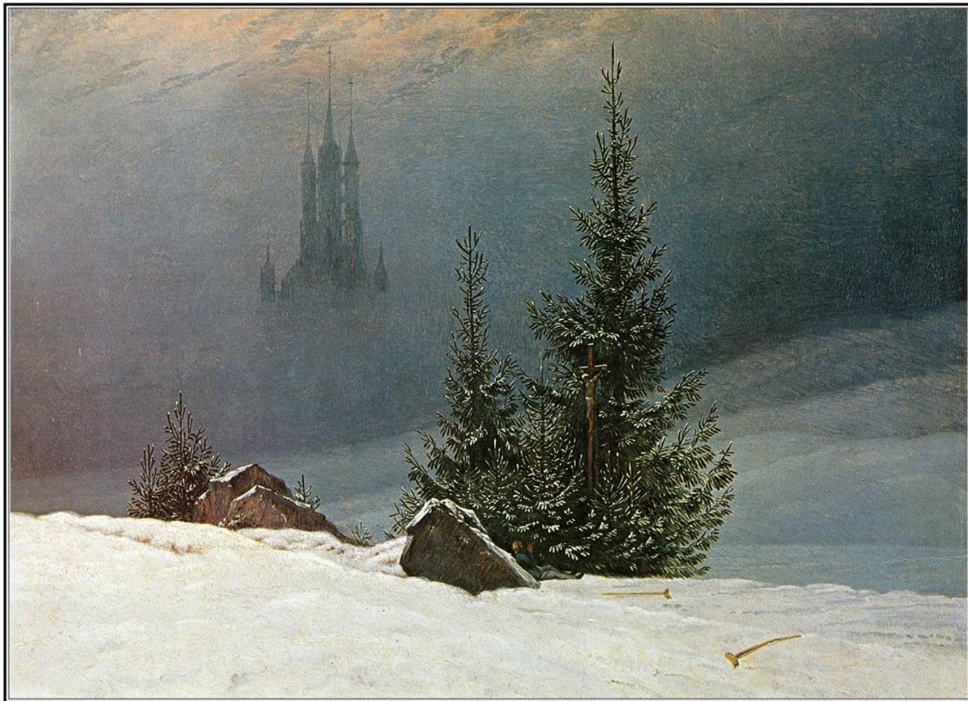
Winter Landscape with Church, Caspar David Friedrich, 1811

The feast of Epiphany, manifestation, concludes the Christmas season with a celebration of God's glory revealed in the person of Jesus Christ. In Isaiah, that glory is proclaimed for all nations and people. Like the light of the star that guided the magi to Jesus, the light of Christ reveals who we are: children of God who are claimed and washed in the waters of baptism. We are sent out to be beacons of the light of Christ, sharing the good news of God's love to all people.