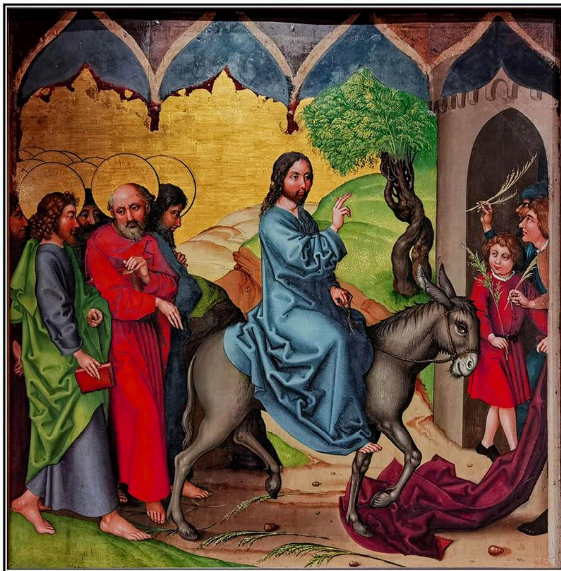
Jesus Entering Jerusalem on a Donkey, Martin Schongauer, 1480

This week, the center of the church's year, is one of striking contrasts: Jesus rides into Jerusalem surrounded by shouts of glory, only to be left alone to die on the cross, abandoned by even his closest friends. Mark's gospel presents Jesus in his complete human vulnerability: agitated, grieved, scared, forsaken. Though we lament Christ's suffering and all human suffering, we also expect God's salvation: in the wine and bread, Jesus promises that his death will mark a new covenant with all people. We enter this holy week thirsty for the completion of God's astonishing work.